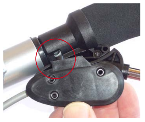
12. Push in the peg into the hole in the handle tube and screw the cover in place. Replace all as in picture 7, 6, 5, 4, 3, 2, 1.