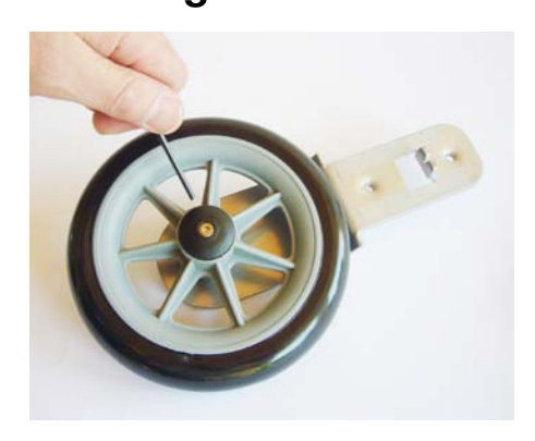
1. To exchange a wheel first unscrew the Allen screw in the middle of the wheel cap and remove the cap.