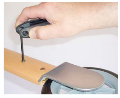
1. Unscrew the two Allen screws at the bottom end of the rear profile.