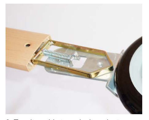
3. Turn it upside to make it easier to loosen the wire from its fixture.