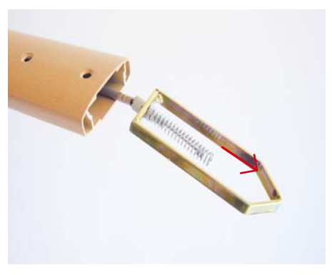
4. Remove the spring from the end of the wire.