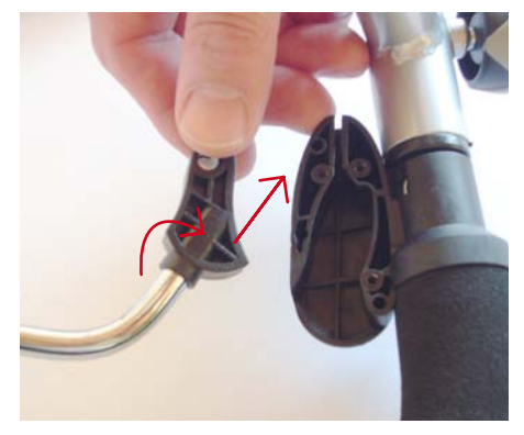
10. If the Brake Inner Part is damaged it can also be exchanged. Turn it a quarter of a turn and pull it off the bow.