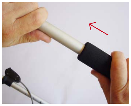
5. Remove the brake housing from one side of the tube. Push the new rubber on. Use soap and water to make it slide.