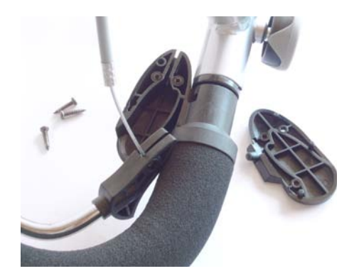
9. Loosen the wire from the Brake Inner Part at the brake bow. The wire can now be exchanged for a new wire.