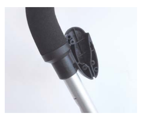
6. Put back the brake housing on the handle tube and then put the handle back into the rollator.