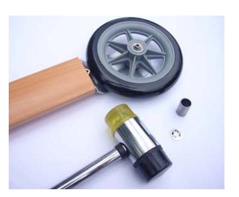
5. To fix the starlock washer use a mallet and a piece of metal tube 15 – 16 mm diameter.