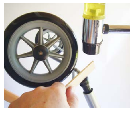
5. Use the wooden stick as protection. Hit the bearing from under with the mallet.