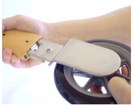
2. Pull out the rear wheel and the brake mechanism.