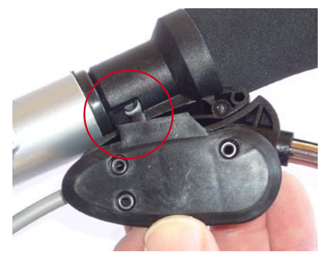
8. Push in the peg into the hole in the handle tube and put the cover in place.