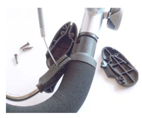
7. Put back the wire into the plastic inner part. Then put the inner part with wire and brake bow into the brake housing.