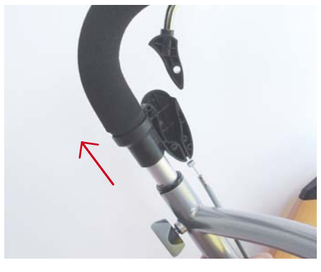
2. Remove the wires and brake bow from the brake housing, both sides. Now you can pull up the handle from the rollator.