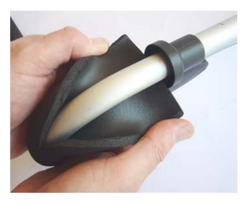
4. Pull off the old rubber entirely from the handle tube.