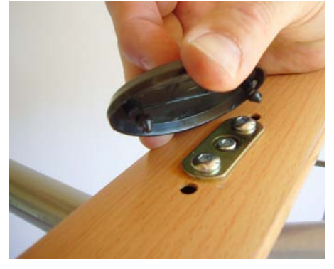
2. Let the pegs under the new Joint Cover fit into the holes in the rear profile.