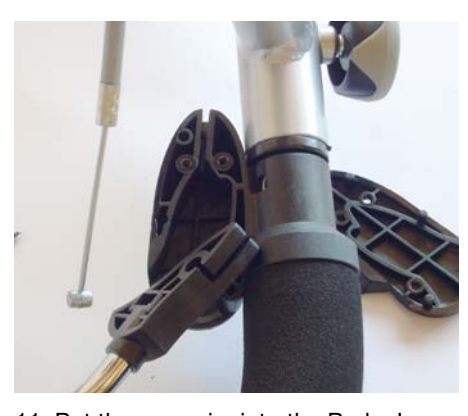
11. Put the new wire into the Brake Inner Part. Put the wire into the rear profile as shown in picture 7, 6, 5, 4, 3, 2, 1.