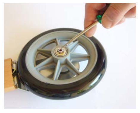
2. Break loose the starlock washer with an awl.