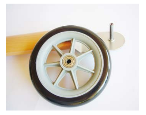
3. Remove the old wheel and the old bearings from the axle.