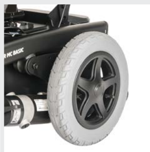
Puncture-resistant pneumatic tyres