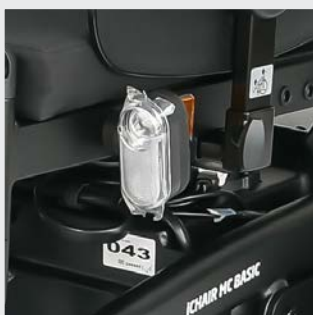
Long-life LED lighting